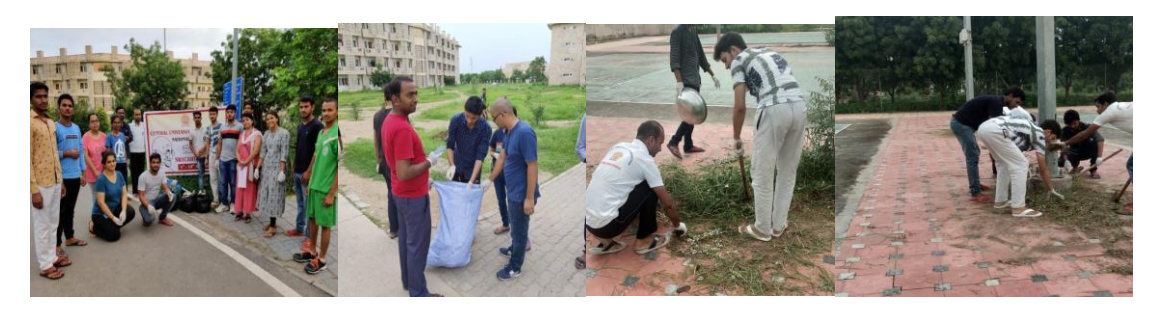
Awareness Campaign at Govt. School, Nohariya Village