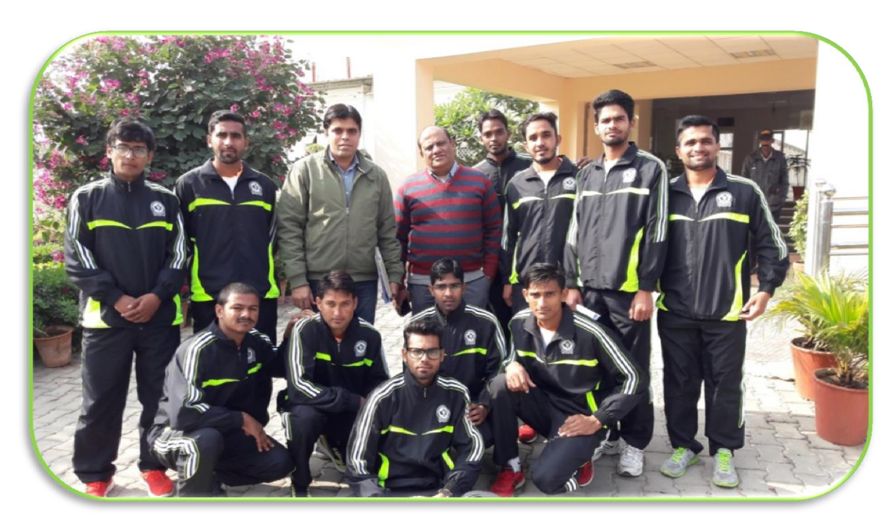
CURAJ WEST ZONE INTER-UNIVERSITY KABADDI TEAM (MEN) 2016-17