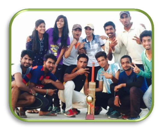
Curaj cricket league CCL-2k16