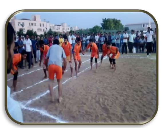
CURAJ kabaddi league