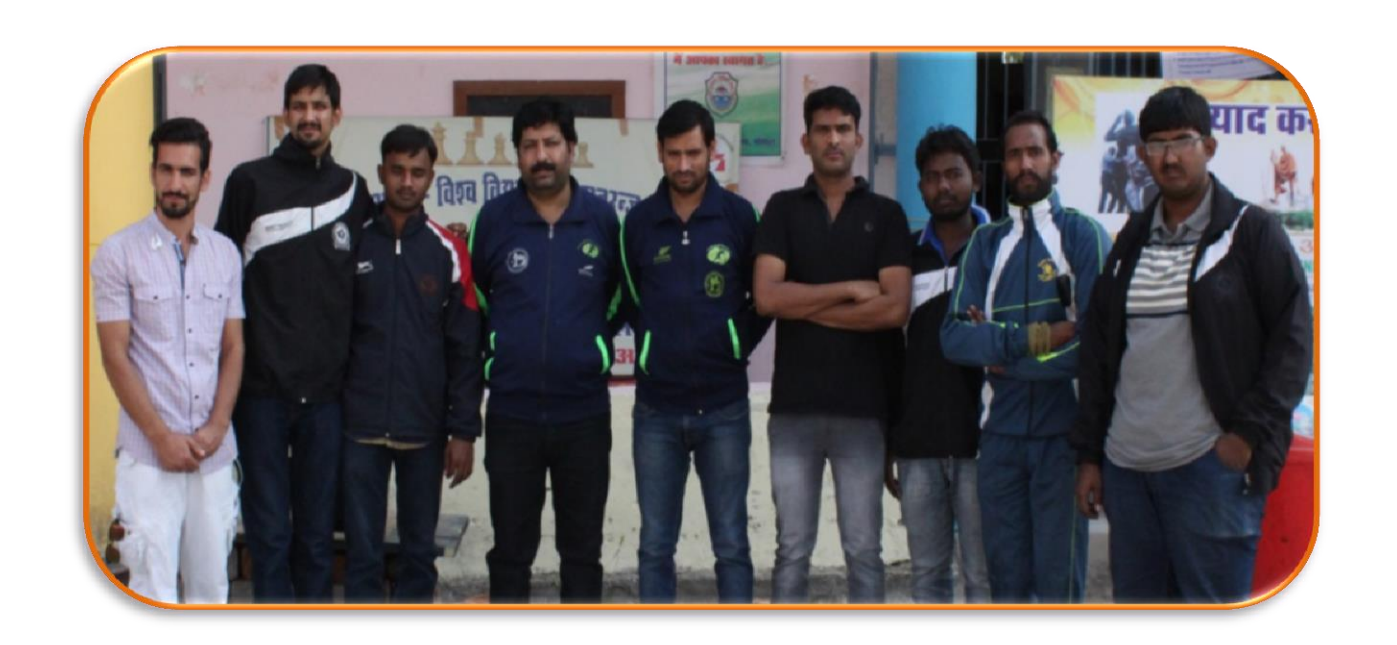
CURAJ WEST ZONE INTER-UNIVERSITY CHESS TEAM (MEN) 2016-17