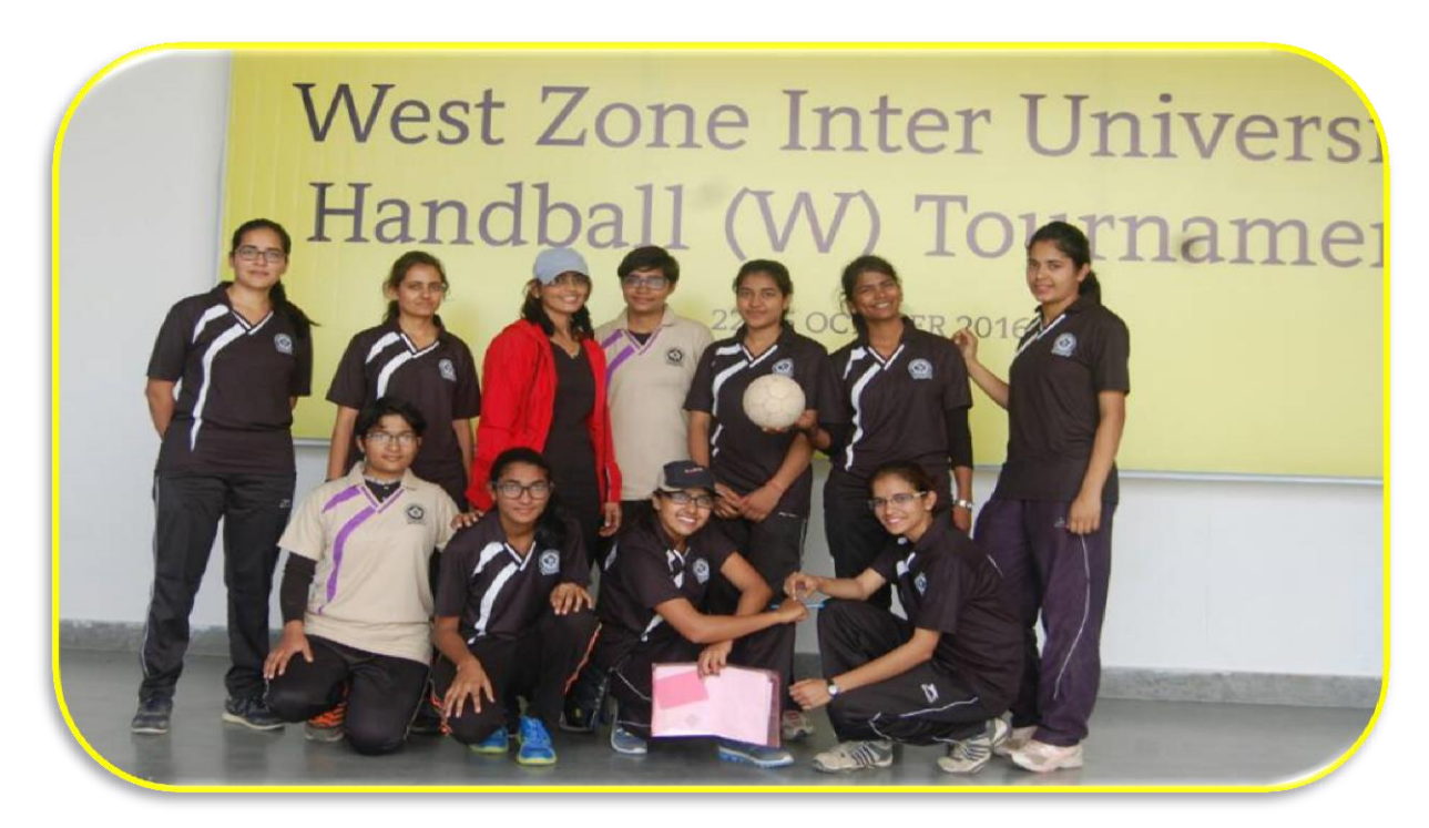
CURAJ WEST ZONE INTER-UNIVERSITY HANDBALL TEAM (WOMEN) 2016-17